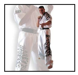
Semi Contact Clothing